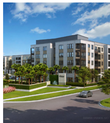
Infield Apartments (Kissimmee, FL)