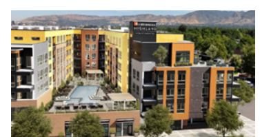
(from top to bottom) Cottonwood Broadway, Cottonwood Highland (both in Salt Lake City, UT)